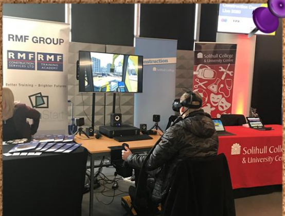
Trying out the Simulators with RMF Group in Birmingham at Plant Construction Careers Live - 04/02/20