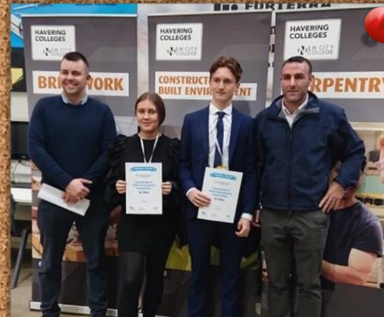
Attended Havering College as part of the National Apprenticeship Week Activities - 03/02/20