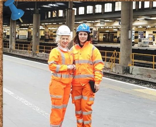
Women into Construction visited IP Central with our employees as part of the Moving on Up Programme - 03/02/20