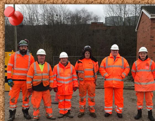
DSG delivered Plant Vehicle Marshall Training on the BAM Nuttall Flood Alleviation Scheme in Leeds - 24/02/20