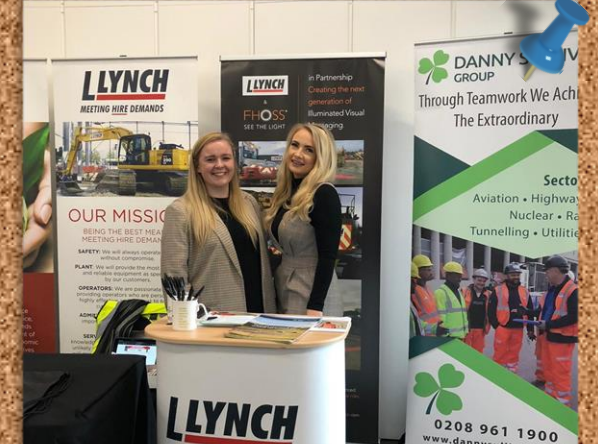
DSG collaborated with Lynch on a stand in Birmingham to talk to young people entering the industry - 04/02/20