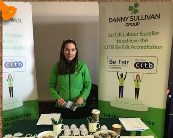
Our Senior HR Manager attended the Balfour Beatty recruitment event in Kent - 06/02/20

Through Teamwork We Achieve The Extraordinary