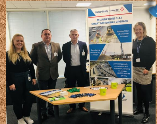
With our clients Balfour Beatty Vinci M4 Smart Motorway at a Build Force Military Recruitment event - 24/10/19