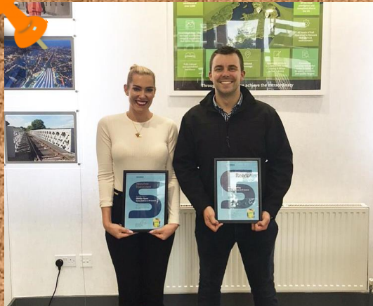
Awarded an IFE Award at the Skanska ZAF Conference for our work at IP Central, Euston - 11/10/19

Through Teamwork We Achieve The Extraordinary