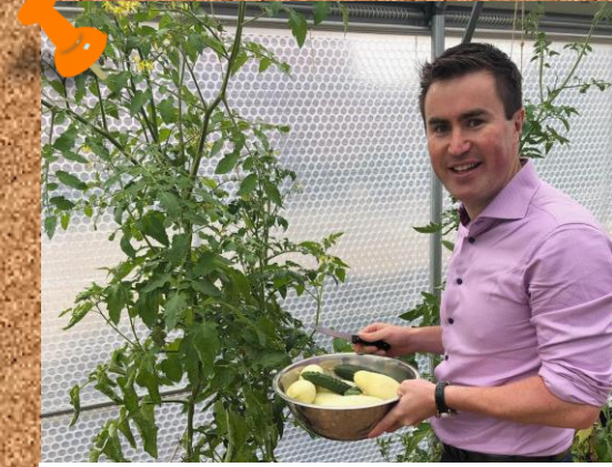
Visiting the Story Garden initiative in Kings Cross with Skanska and Network Rail– 03/10/19