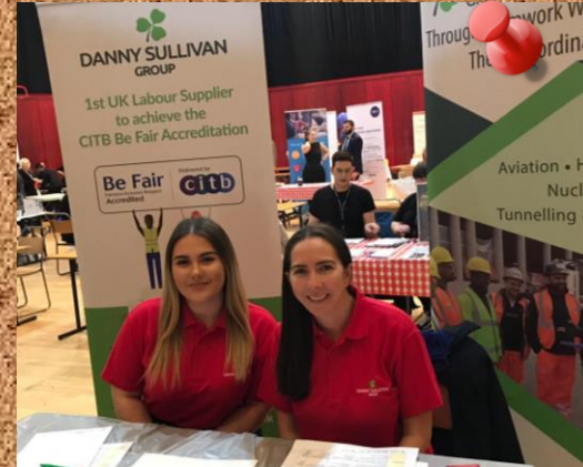
Inductions team attended a Jobs Fair In Reading to encourage local recruitment – 02/10/19