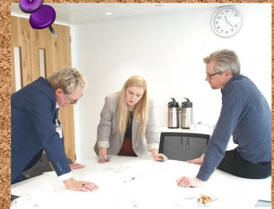
Attending the 1 st Managers session on the Women into Construction 'Moving on Up' programme - 15/10/19