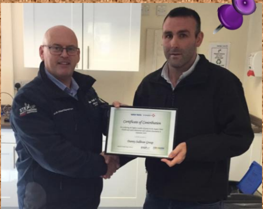
DSG were the 1 st company to score 300+ points on the M6 BBV Project's Safety Behaviours Pyramid- 19/10/19