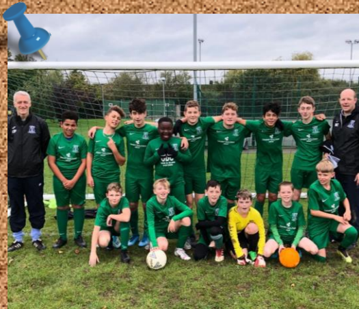
DSG proudly sponsored Football Kits for Ruislip Town Football club – 05/10/2019