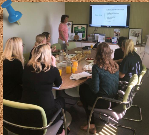
4 th DSG Lunch and Learn on Top Excel Tips hosted by our Finance Director – 29/08/2019