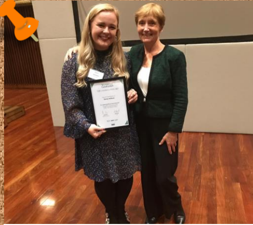
DSG awarded at the Women Into Construction event 2019 for supporting the initiative - 26/09/19

Through Teamwork We Achieve The Extraordinary