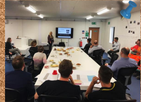
DSG collaborated on a Lunch and Learn with BMB, Tideway West for National Inclusion Week - 25/09/19