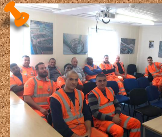
Delivered a FIR session at C512 BMW Whitechapel during National Inclusion week - 23/09/19