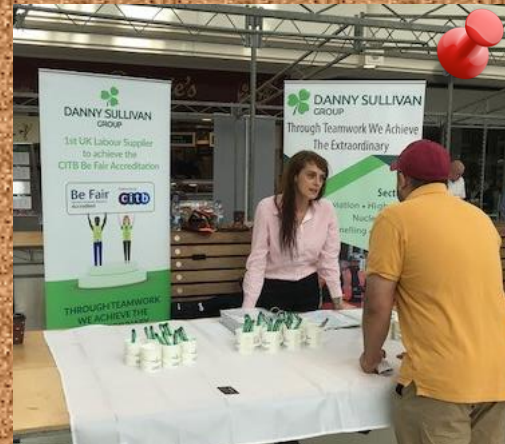
Inductions team attended a Jobs Fair In Uxbridge to encourage local recruitment - 17/09/19